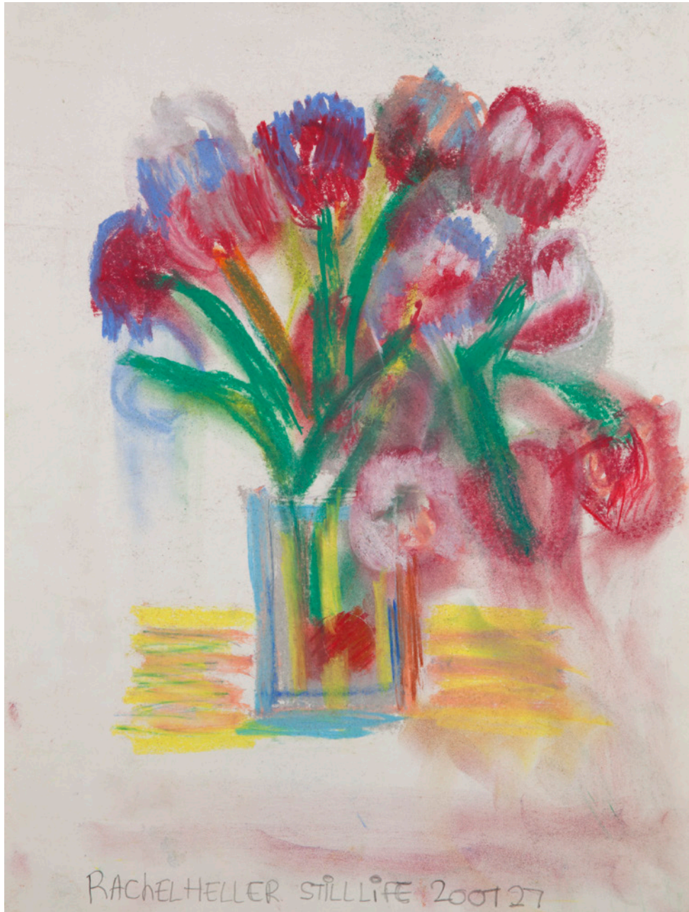
Still Life , 2007 Pastel on paper 42 x 30 cm 16 1/2 x 11 3/4 in