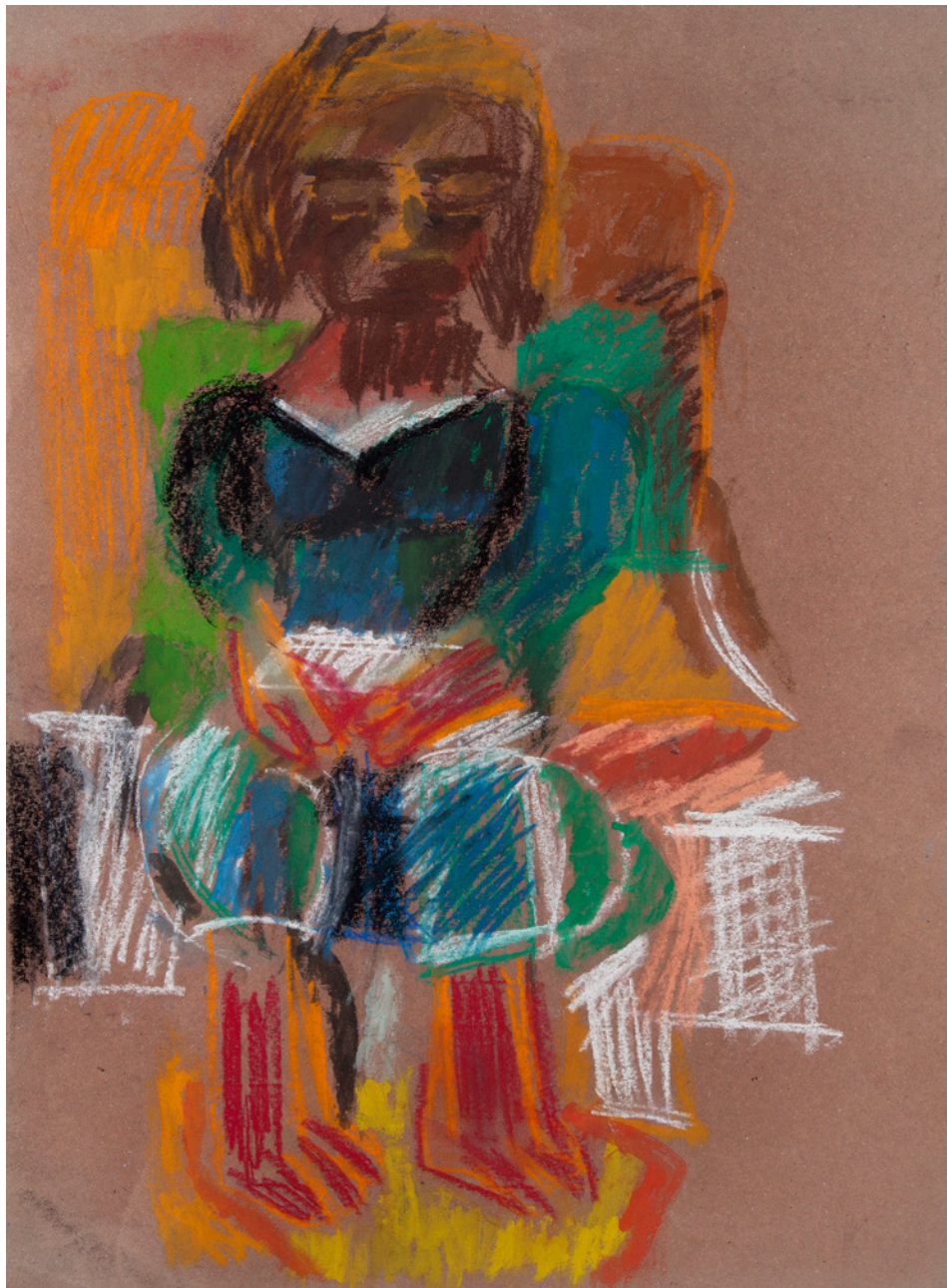
Sit Down Prose , 2016 Pastel on paper 43.5 x 59.5 cm 17 1/8 x 23 3/8 in