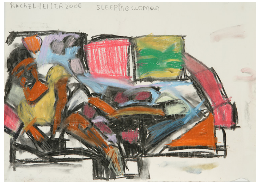
Sleeping Woman, 2006 Pastel and charcoal on paper 43 x 59.5 cm 17 x 23 1/2 in