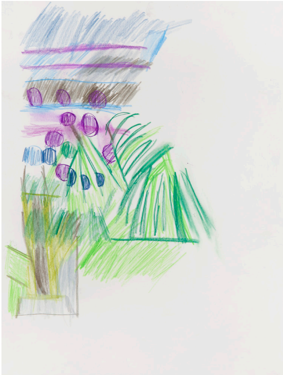
Blue Flowers , 2016 Pastel on paper 42 x 30 cm 16 1/2 x 11 3/4 in