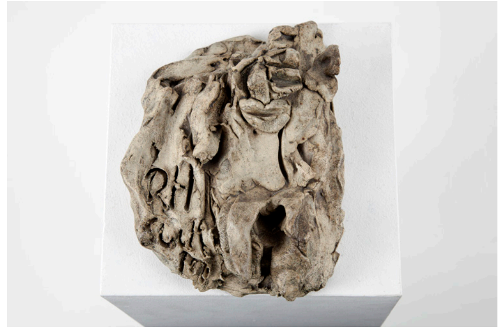
Swimming , 2016 Mixed media 19 x 14 x 7 cm 7 1/2 x 5 1/2 x 2 3/4 in