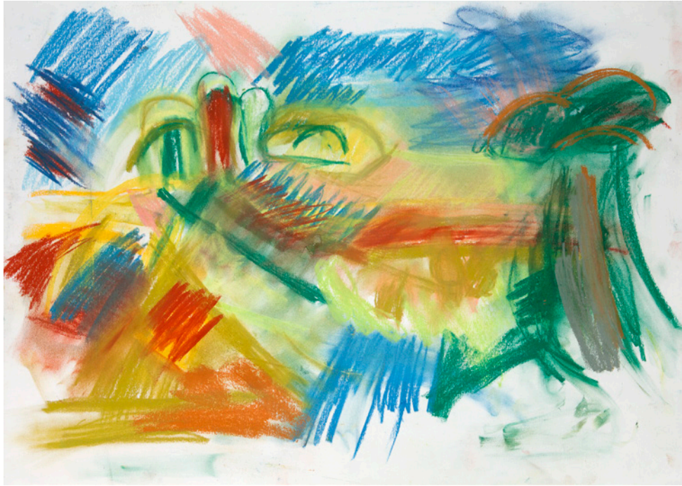
Wittenham Clumps , 2016 Pastel on paper 40 x 58 cm 15 3/4 x 22 7/8 in