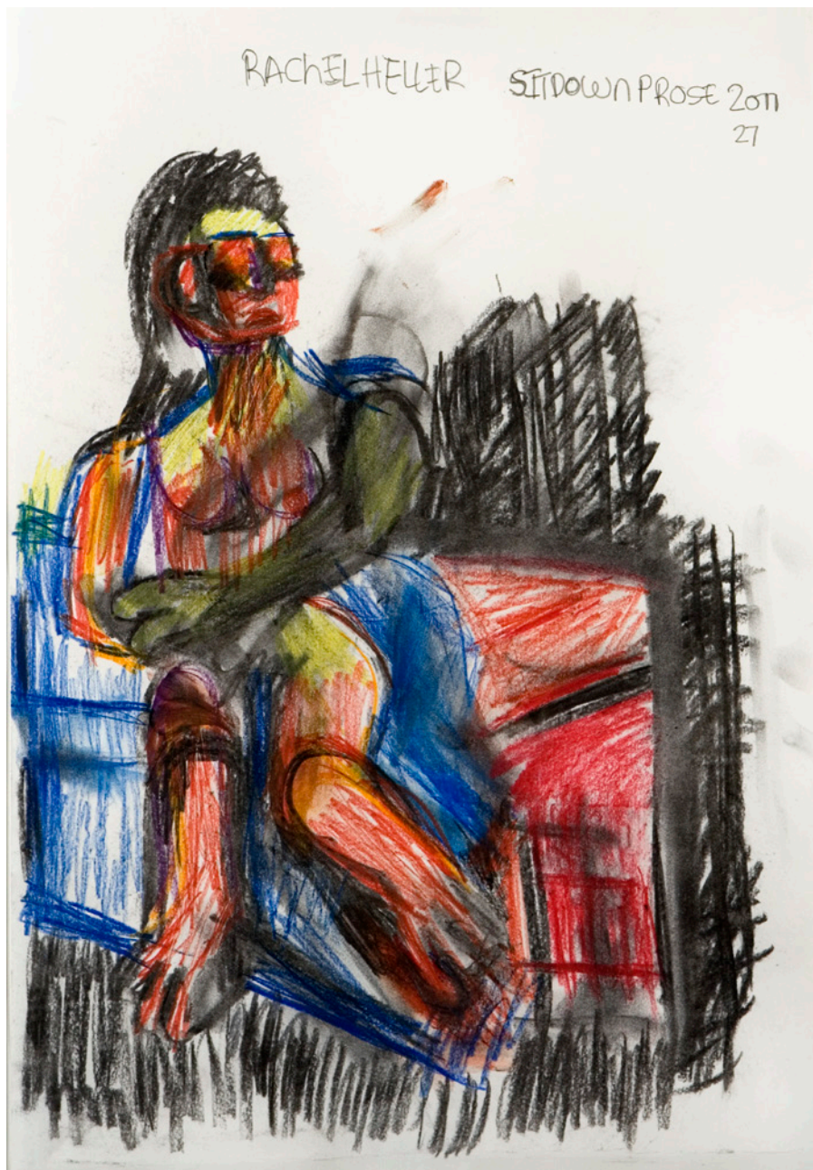
Sit Down Prose , 2011 Pastel on paper 51 x 40.5 cm 20 1/4 x 16 in