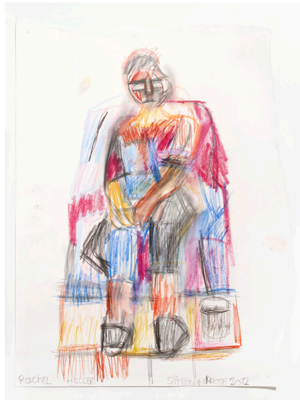
Sit Down Prose , 2012 Pastel and pencil on paper 49 x 37 cm 19 1/2 x 14 3/4 in