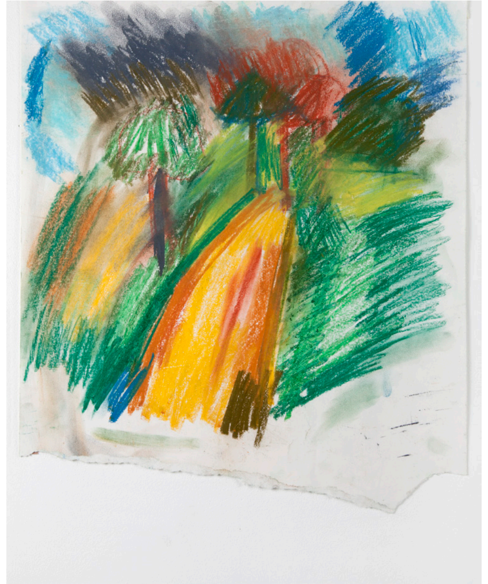
Road , 2016 Pastel on paper 44 x 42 cm 17 3/8 x 16 1/2 in