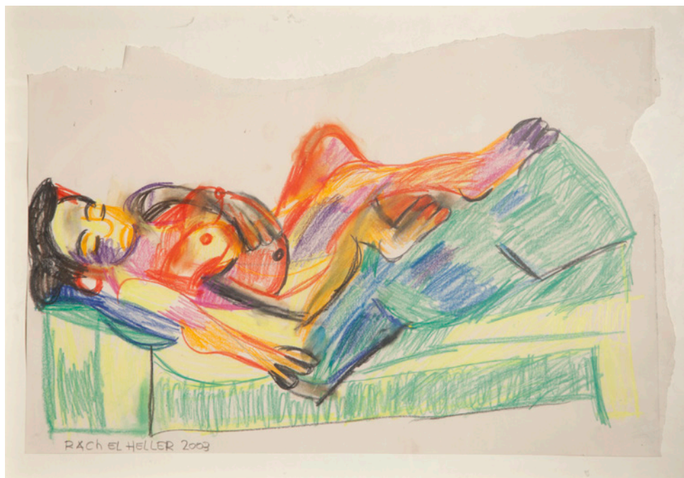
Untitled (nude woman lying down), 2003 pencil, chalk and pastel on paper 30 x 45 cm 12 x 17 3/4 in