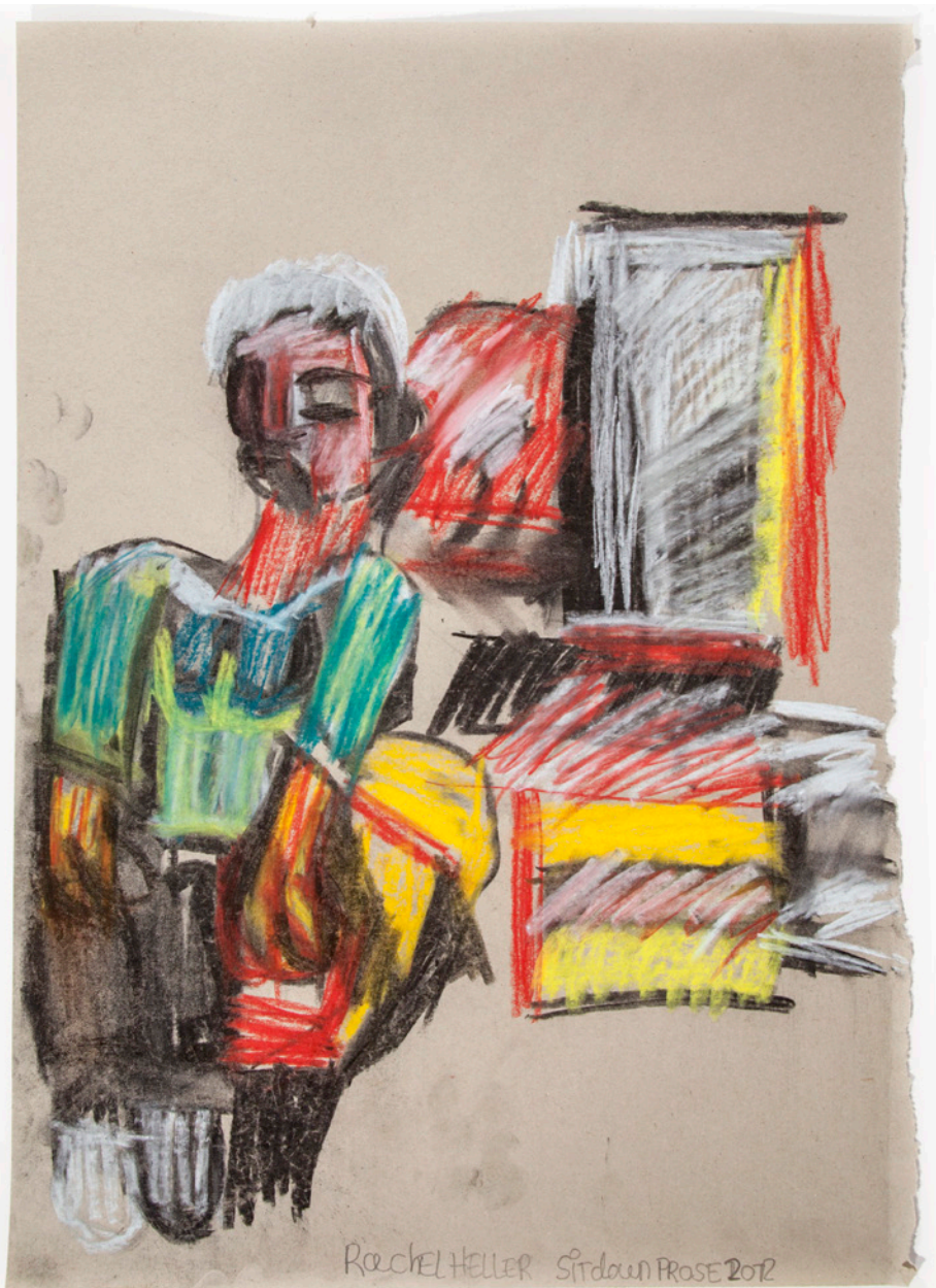
Sit Down Prose , 2012 pencil, chalk and pastel on paper 60 x 41 cm 23 3/4 x 16 1/4 in