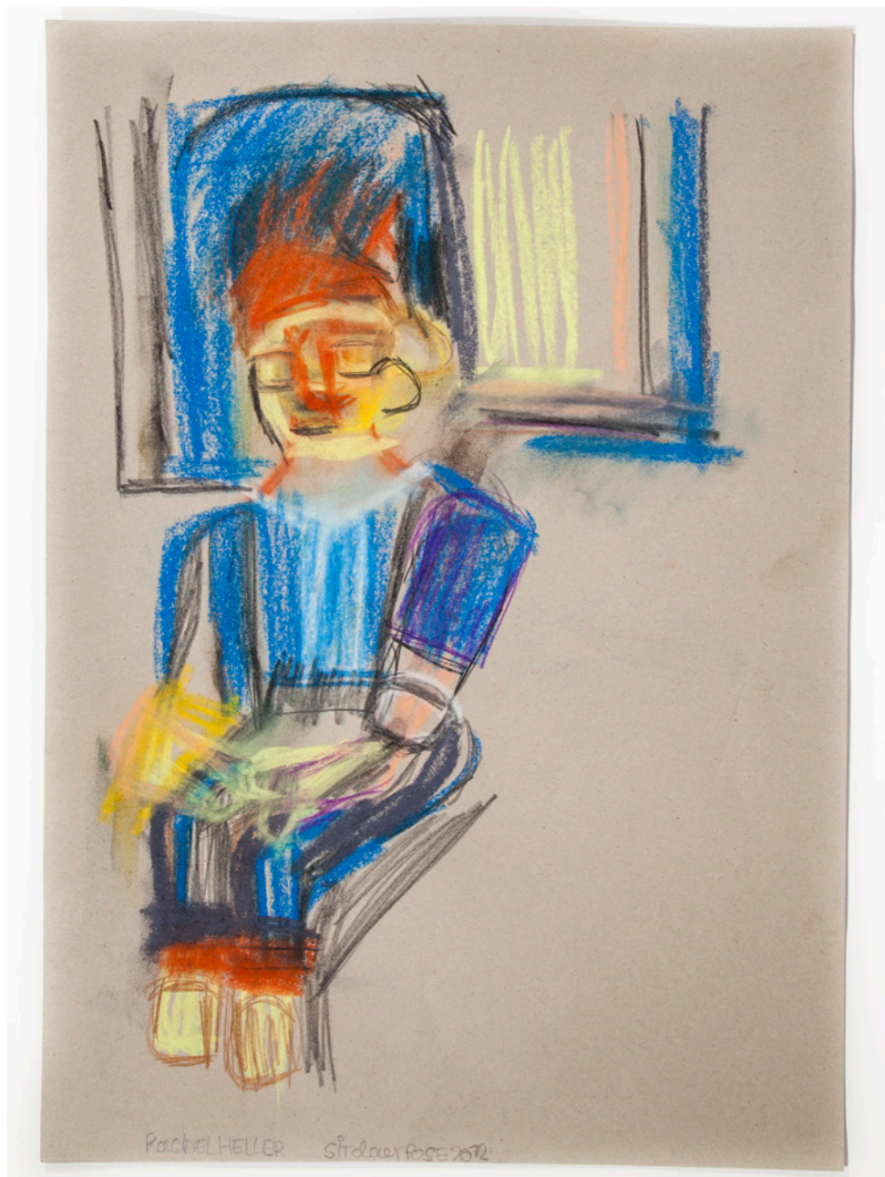
Sit Down Prose , 2012 pencil, chalk and pastel on paper 60 x 41 cm 23 3/4 x 16 1/4 in