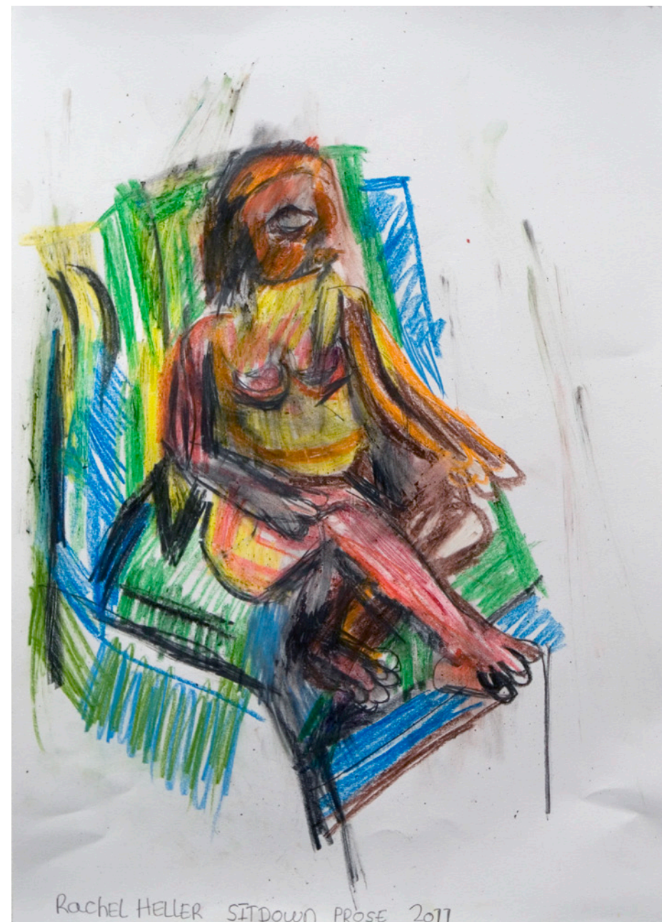
Sit Down Prose , 2011 Pastel and pencil on paper 59 x 42 cm 23 1/4 x 16 3/4 in