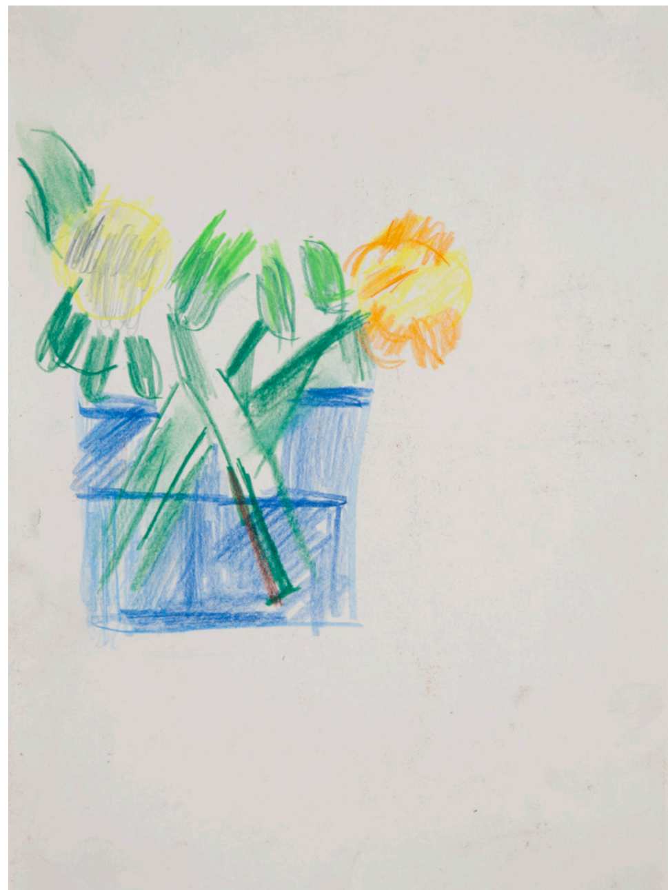
Flowers Still Life , 2016 Pastel on paper 30 x 21.5 cm 11 3/4 x 8 1/2 in