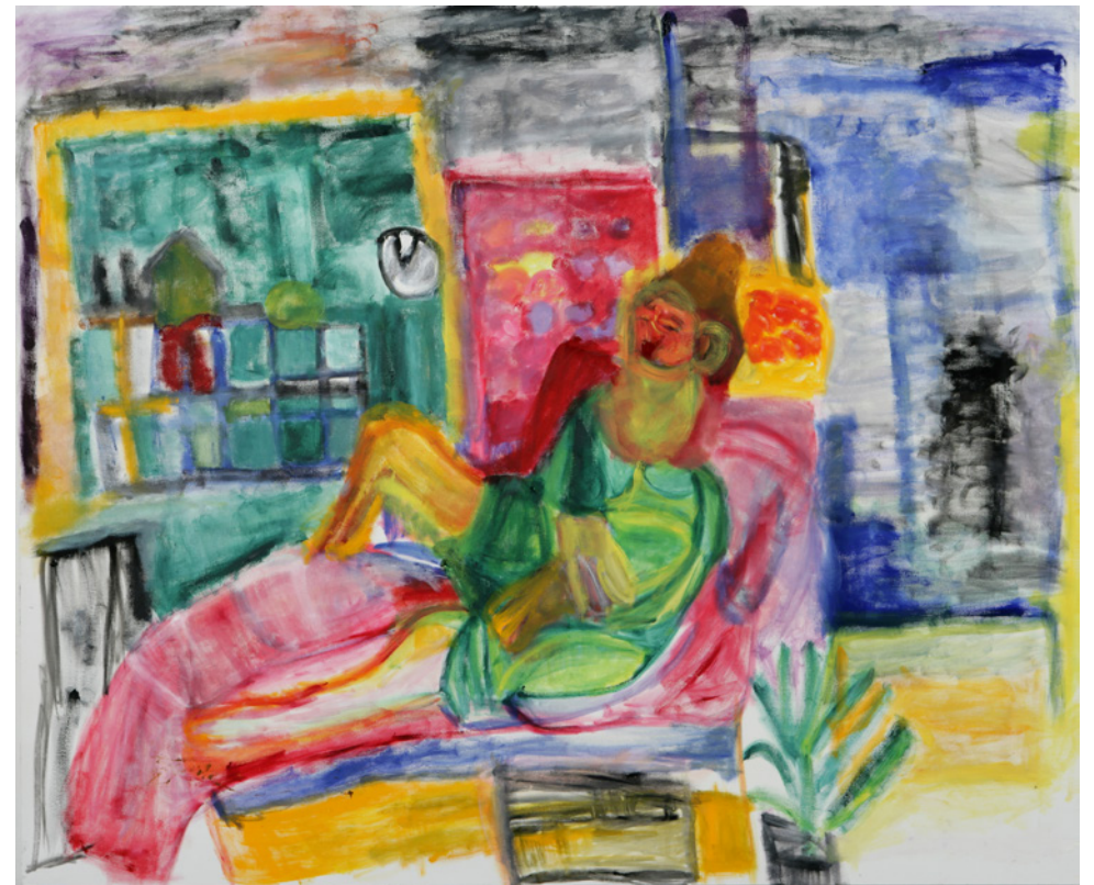
Woman Sleeping, 2001 Oil and mixed media on canvas 153 x 183.5 cm 60 1/4 x 72 1/4 in