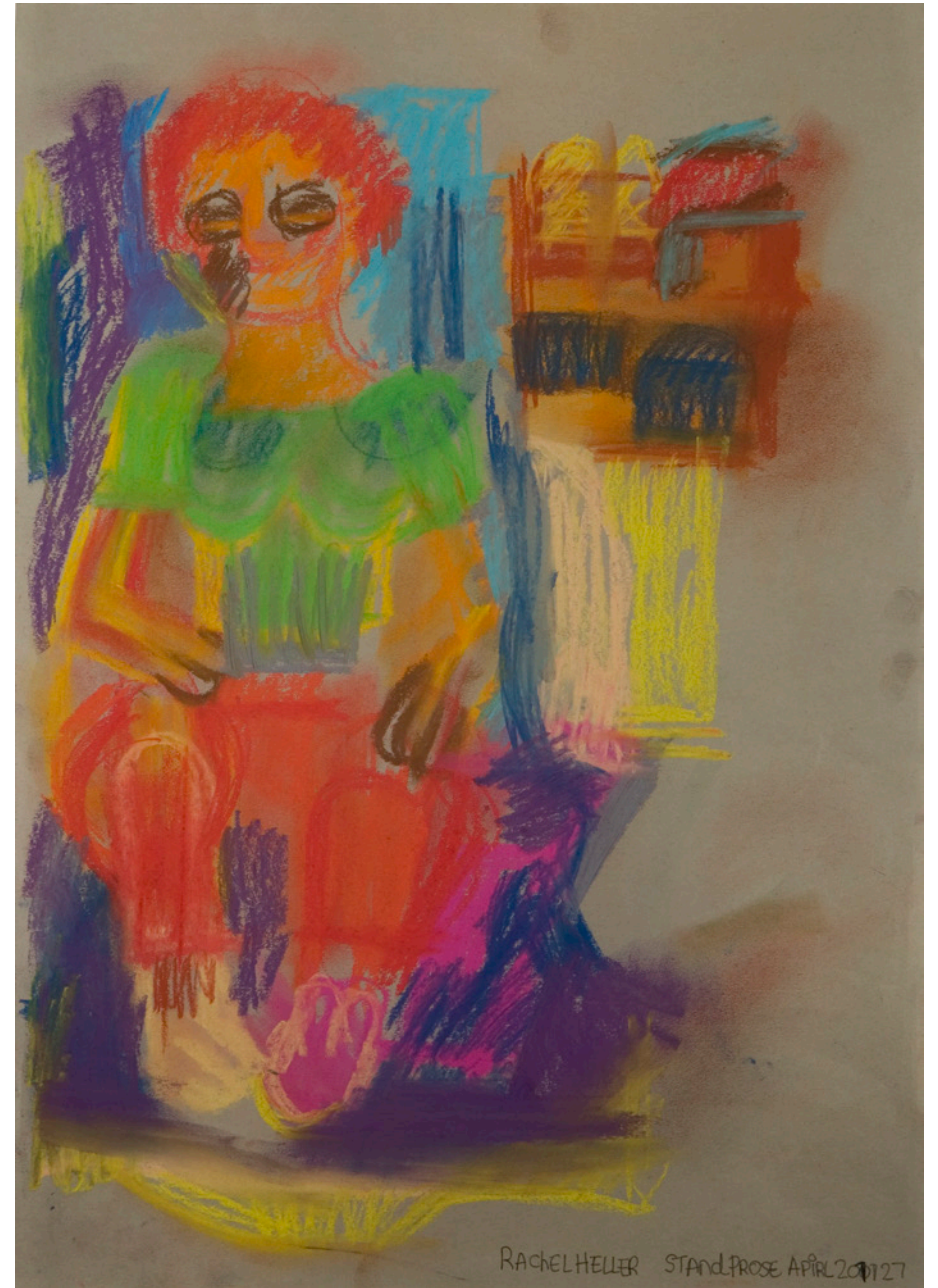
Stand Prose, 2011 Pastel chalk on paper 59.5 x 42 cm 23 1/2 x 16 3/4 in