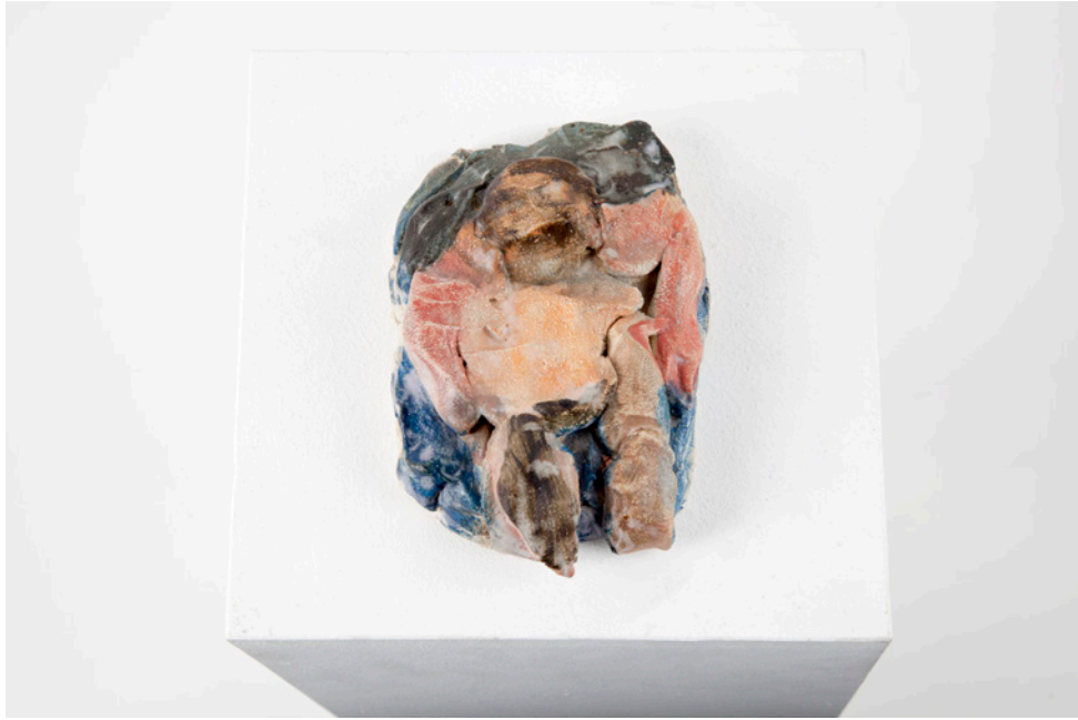
Bob Reading , 2016 Mixed media 15 x 10 x 2 cm 5 7/8 x 4 x 3/4 in