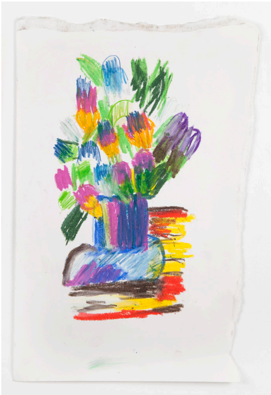
Flowers, 2016 Pastel on paper 43 x 27 cm 16 7/8 x 10 5/8 in