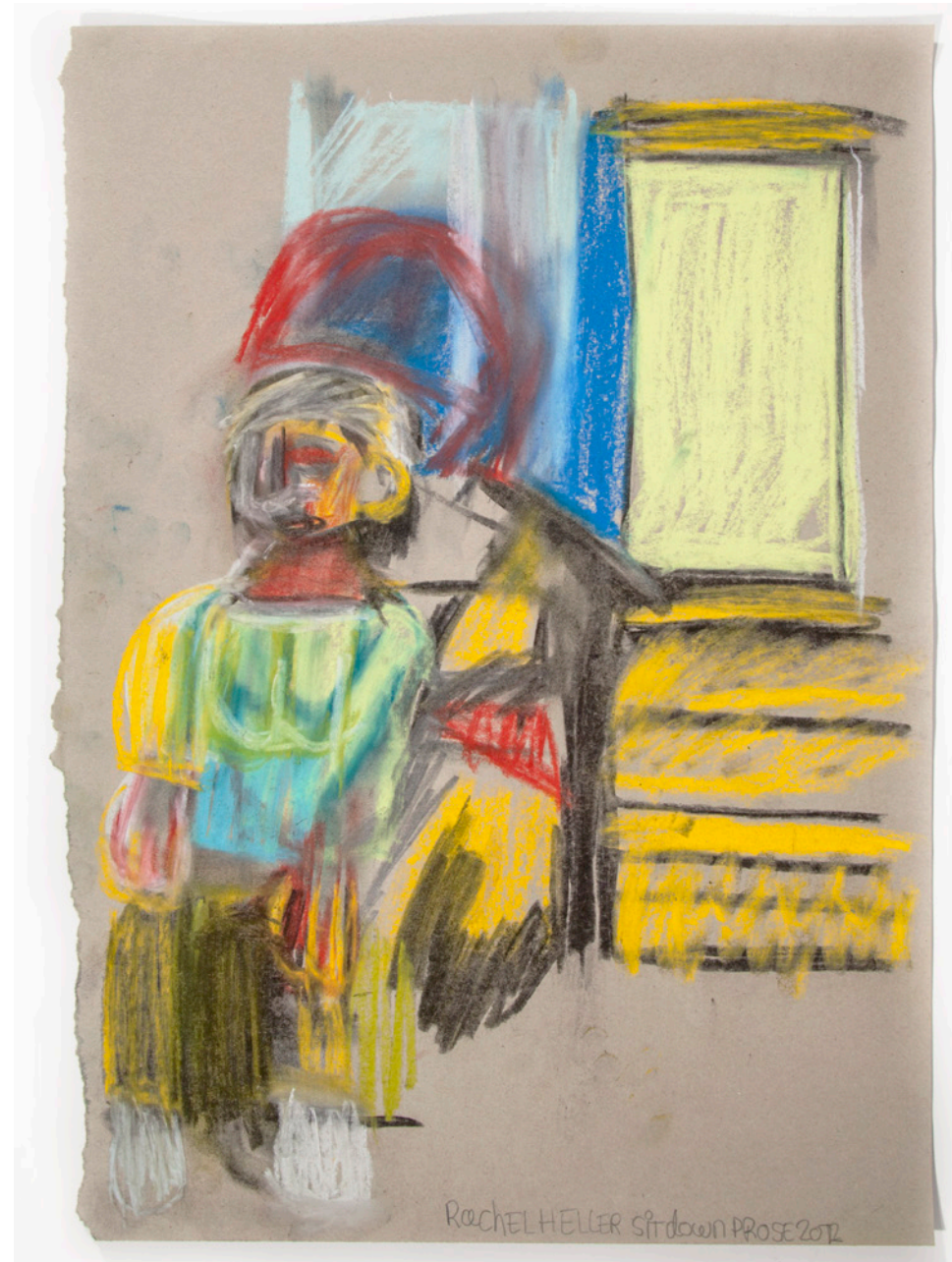
Sit Down Prose , 2012 pencil, chalk and pastel on paper 60 x 41 cm 23 3/4 x 16 1/4 in