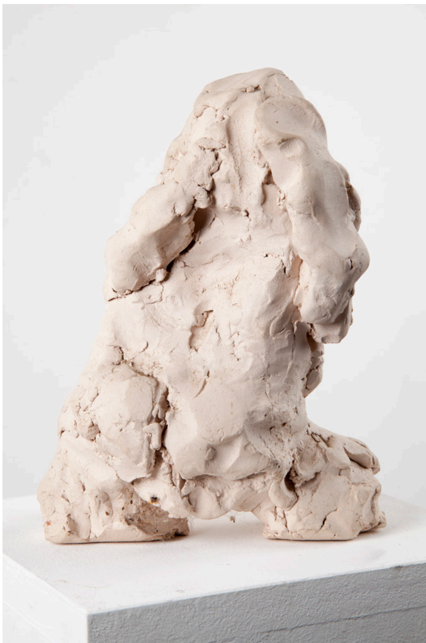
Dancing , 2016 Mixed media 20 x 14 x 12 cm 7 7/8 x 5 1/2 x 4 3/4 in