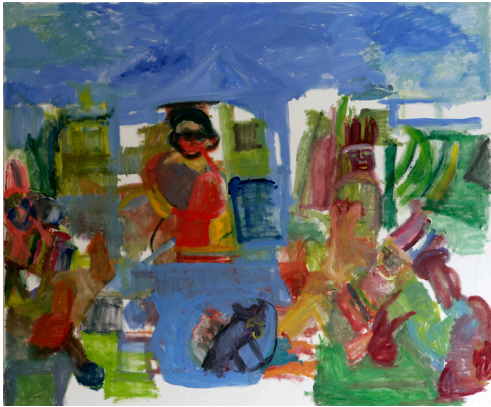
Marde Carden, 2006 Oil on canvas 153 x 183 cm 60 1/4 x 72 in