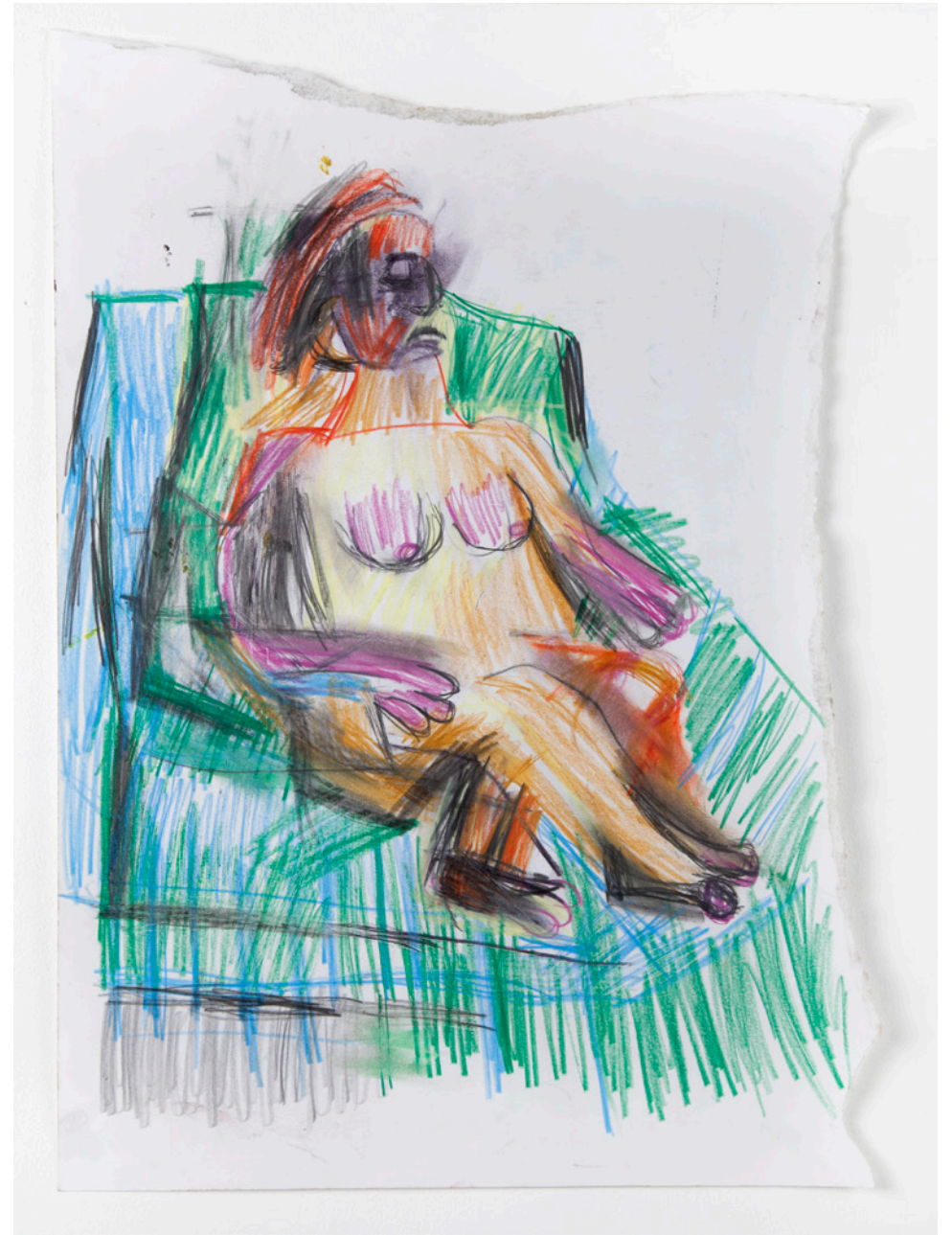
Nude Woman , 2016 Pastel on paper 50 x 35 cm 19 3/4 x 13 3/4 in