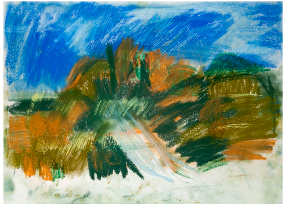
Blue Sky , 2016 Pastel on paper 42 x 59 cm 16 1/2 x 23 1/4 in